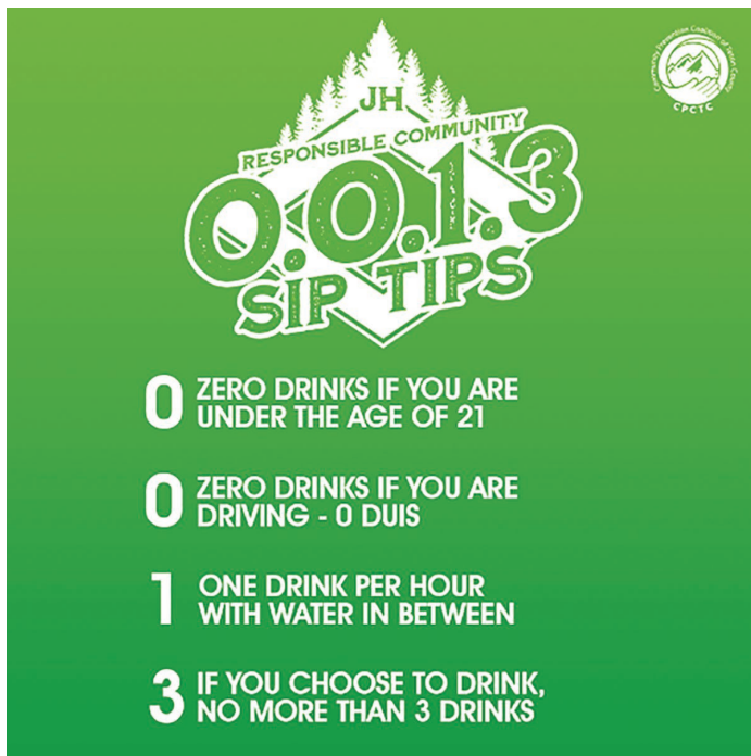
An advertisement from 0.0.1.3 Sip Tips —a campaign to encourage moderation around drinking.

Many local agencies are working to promote a positive shift in daily life by encouraging healthy living, establishing sober-friendly places, providing youth and adult education, and addressing the local party culture. The Community Foundation of Jackson Hole began an initiative called “Mocktail May” which encourages community organizations to offer non-alcoholic drink options at local events and galas for inclusivity. The Community