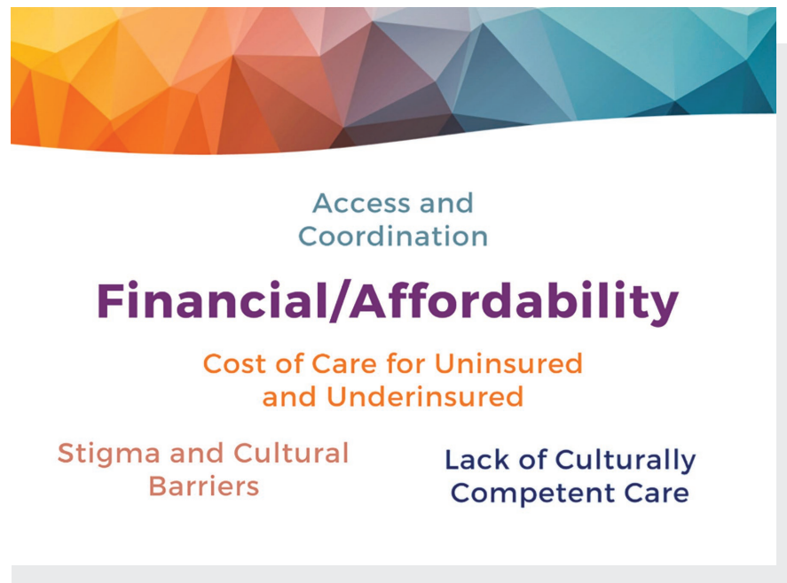
This word cloud image represents the barriers identified from participants at the brainstorm session and from individual agency interviews. The more frequent a topic or barrier was identified, the larger the font of the word. Barriers or topics that have a smaller font came up less often.